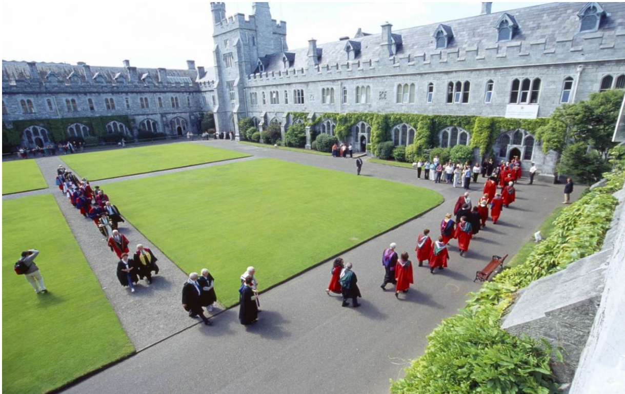
The Main Quadrangle